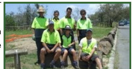
The MSQ Green Army team show off their work efforts adjacent to the northern Spit carpark